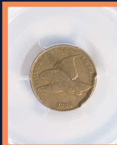
1856 FLYING EAGLE PENNY