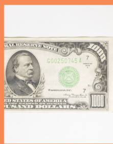
SERIES 1934 ONE THOUSAND DOLLAR BILL