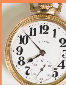
ILLINOIS BUNN SPECIAL POCKET WATCH